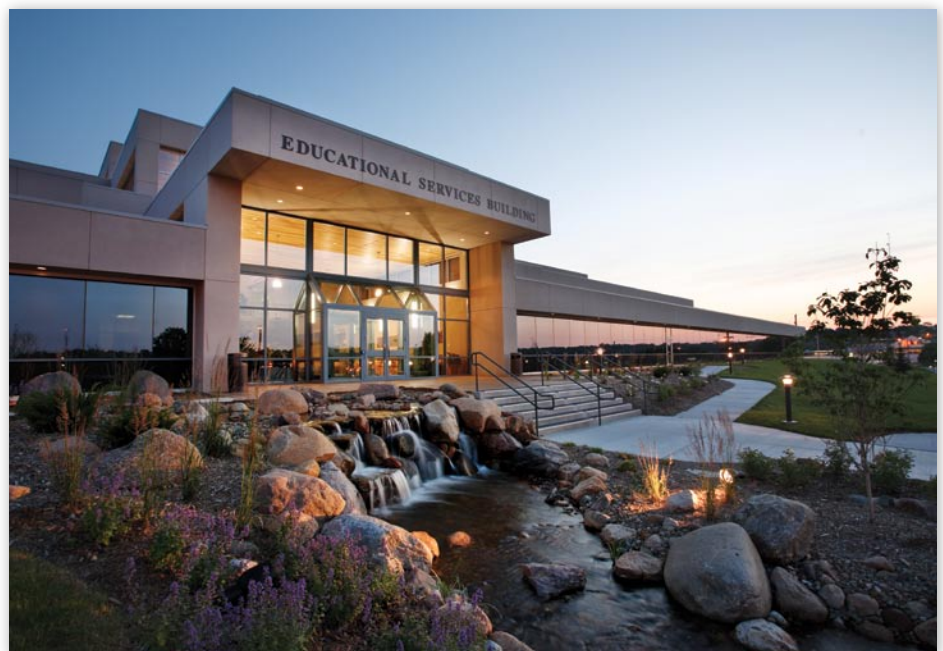
Bellevue University is a world-class leader in adult learning. Nearly 50 undergraduate degree programs, 13 graduate degree programs and a Ph.D. in Human Capital Management are offered. The city's university and remarkable K-12 school system fuel a highly-skilled workforce.