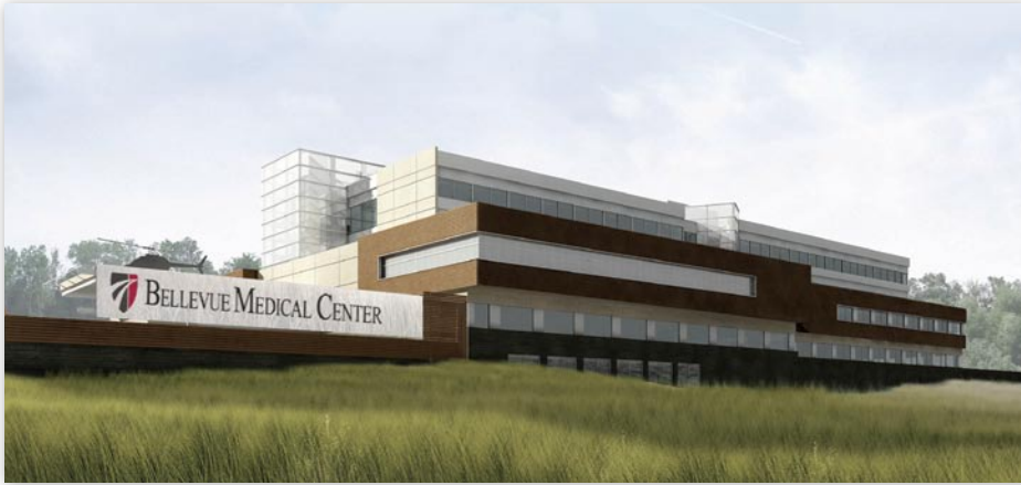
The Bellevue Medical Center is targeted to be the first LEED Certified hospital in the Midwest. It will have 100 private, inpatient beds. Future expansion will allow for an additional 100 beds. The Center will also serve as a teaching hospital and training facility for the Air Force physicians, including approximately 20 percent of the Air Force's staff of family practice physicians.

feature state-of-the-art diagnostic services and equipment, including a cardiac catheterization lab, radiology, lab testing, and pharmacy on the premises. The result of the recent growth of the medical sector is increasing interest in more medical office buildings – which are already in the planning stages. Bellevue's location on the Nebraska/Iowa border and growing population are factors driving the current medical trend.