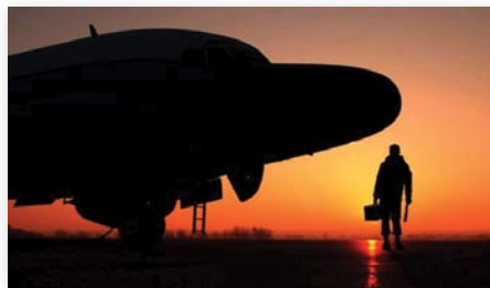
Offutt Air Force Base calls Bellevue, Nebraska home. One of the largest installations in the world with nearly 12,000 military and federal employees in 93 units representing the four branches of the military, Offutt's economic impact is more than $2.4 billion to the community.

T he American dream is alive and well in Bellevue, the third largest city in Nebraska. Nationally, the “Cornhusker State” was named by Forbes Magazine as 9th best for business. The city boasts a highly-educated workforce, an impressive infrastructure for urban technology, affordable cost of living, top ranked K-12 schools, and beautiful parks and trails. Known as the birthplace of Nebraska, this city of nearly 80,000 is located in the heartland of the country – along the banks of the Missouri River.