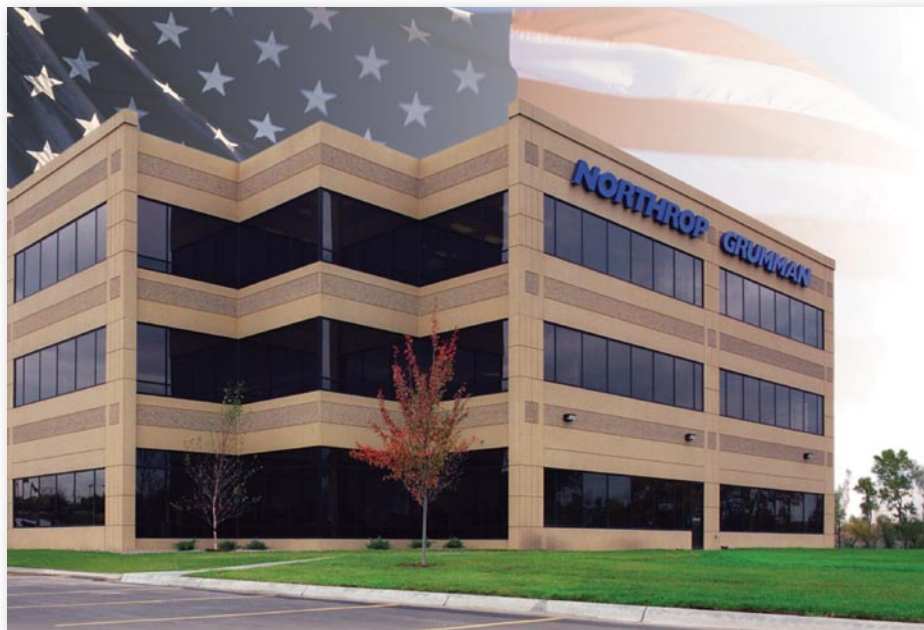
Bellevue's strategic location, high-tech labor pool, extensive telecommunications system, and urbanized infrastructure make it an ideal place for tech-centric companies like Northrop Grumman.

Bellevue broke ground recently on their newest industry -- the medical sector. The community is enjoying a newly completed $8 million Alegenat medical clinic and looking forward to the opening of the Bellevue Medical Center in 2010. The Center is a $100 million capital investment in the community that will employ 500 people. “Bellevue is Nebraska's third largest city and we needed a hospital to serve our community and our future growth,” according to Bellevue Mayor Gary Mixan. He added, “it is exciting to watch the hospital being built.” The hospital will provide labor and delivery care, emergency care, inpatient and outpatient surgery, and intensive care. Facilities will